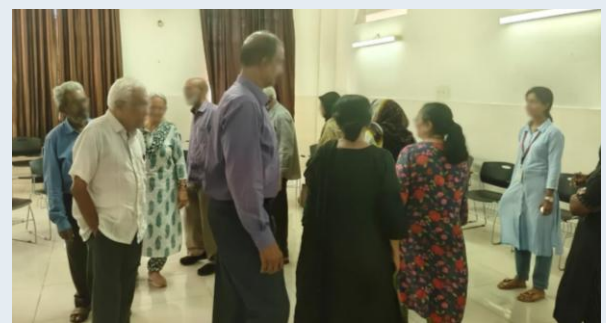
Pictured: Older Adults taking part in activities at the Wellbeing Café organised by The Institute of Mental Health and Neurosciences, Kozhikode, Kerala

The Institute of Mental Health and Neurosciences, Kozhikode, Kerala started a weekly Wellbeing Café in December 2023, initially welcoming just two participants from the geriatric clinic. The primary aim of the initiative was to foster a sense of community, reduce loneliness, and offer stimulating activities.