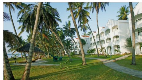
Sarova Beach Resort